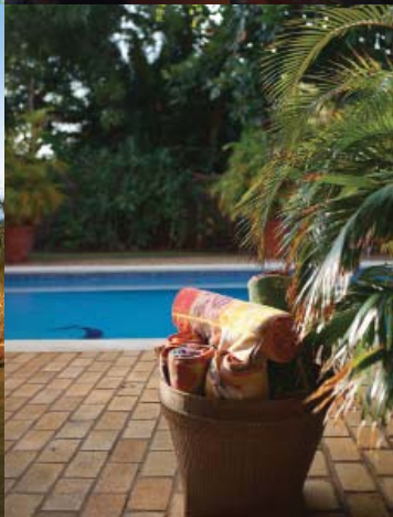
Scenes from a week-end work retreat at Keela Wee, including crystal-blue water, spectacular views, tropical cocktails and gorgeous sunsets. Not shown: actual work.